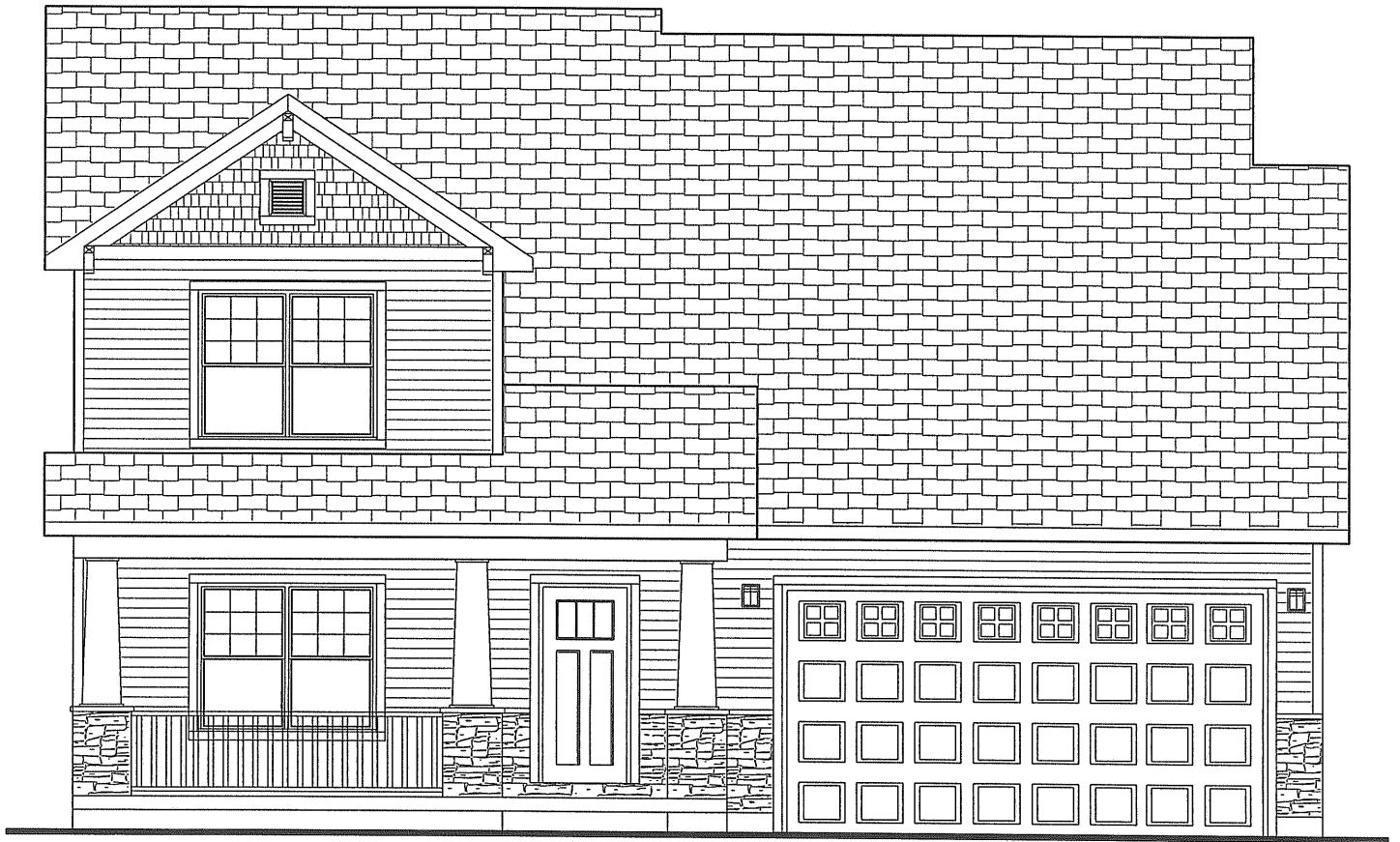
FRONT ELEVATION Burke Cambridge Model