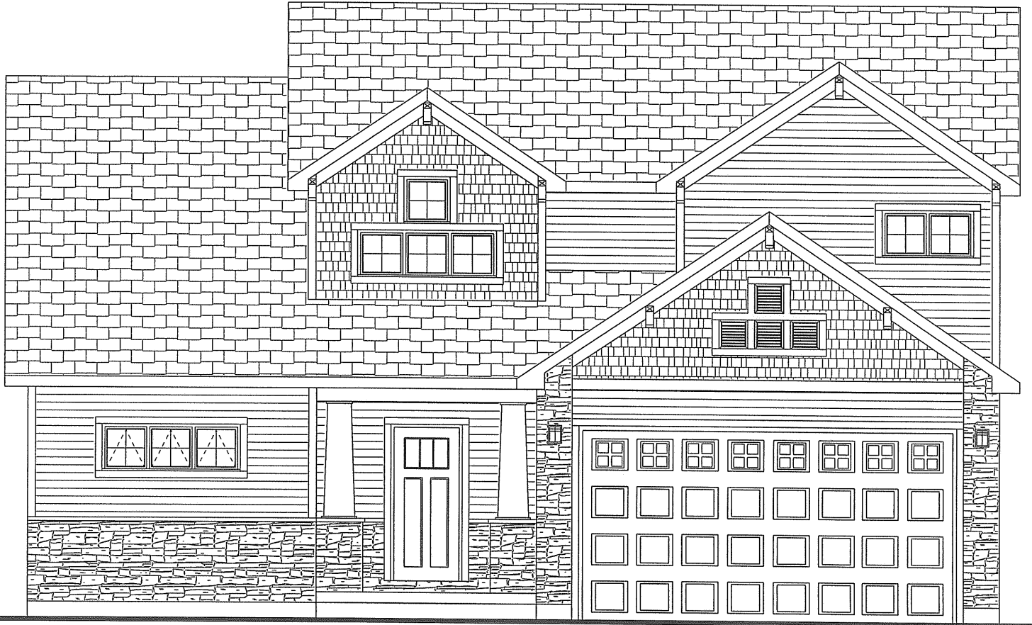
FRONT ELEVATION Burke Andover Model