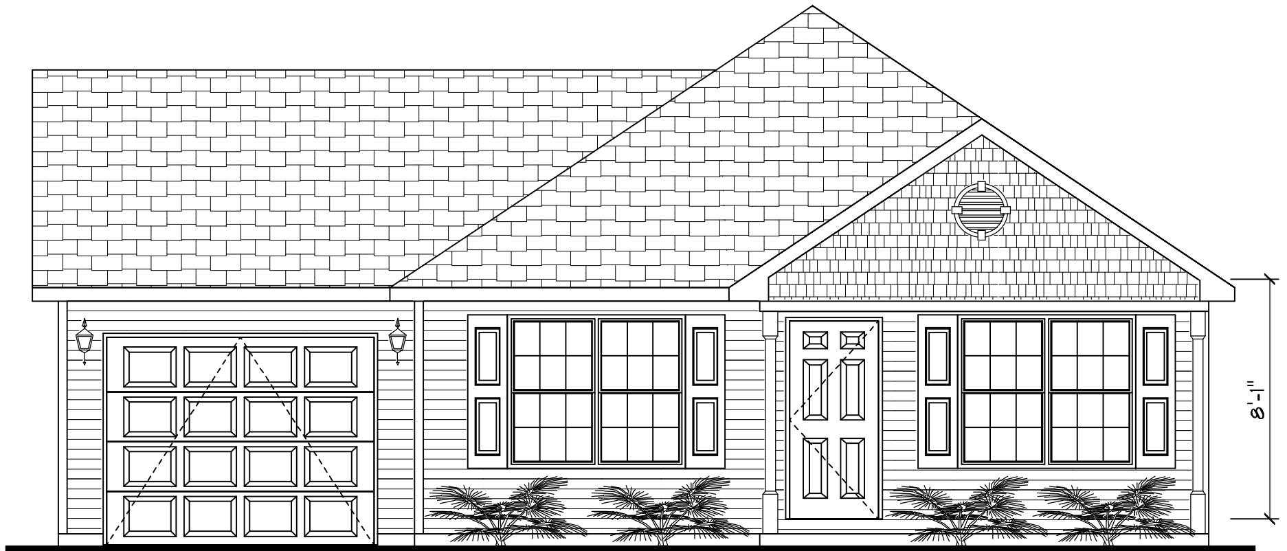
FRONT ELEVATION BURKE ADDISON RANCH