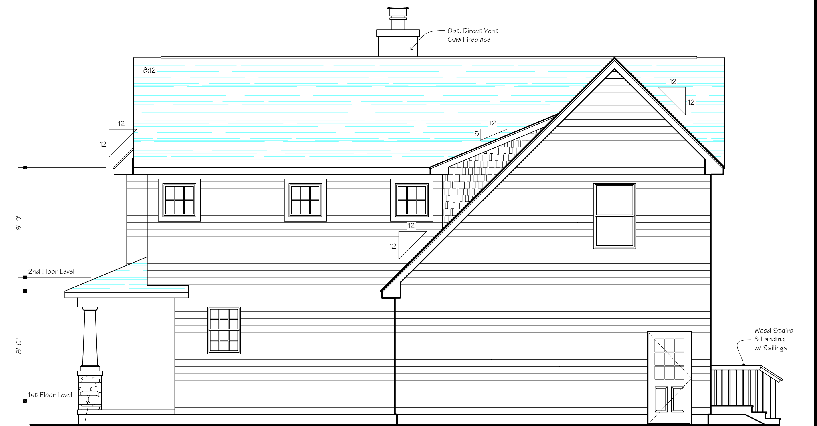
A2.4 Right Elevation